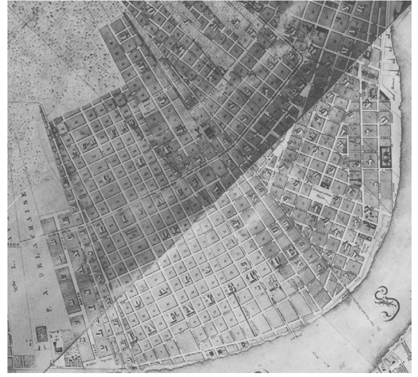
Lafayette's economy rested largely on shipping, particularly the flatboat wharf, where varied cargo from

riverfront, emerged as Lafayette's principal artery, and its intersection with Jackson Avenue formed something of a "downtown."